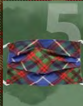
Printed Tartan Face