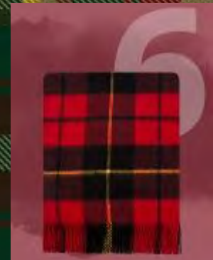
Brushed Wool Tartan