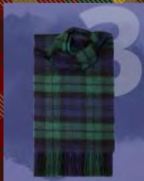
Brushed Wool Tartan