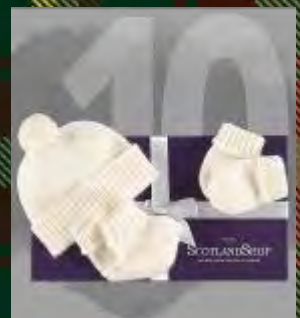
Cashmere Baby Gift Set