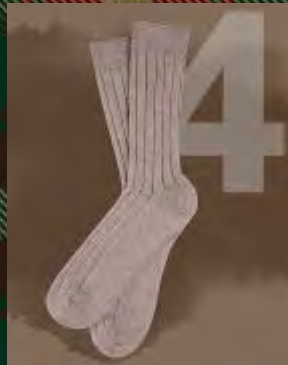
Men's Cashmere Socks