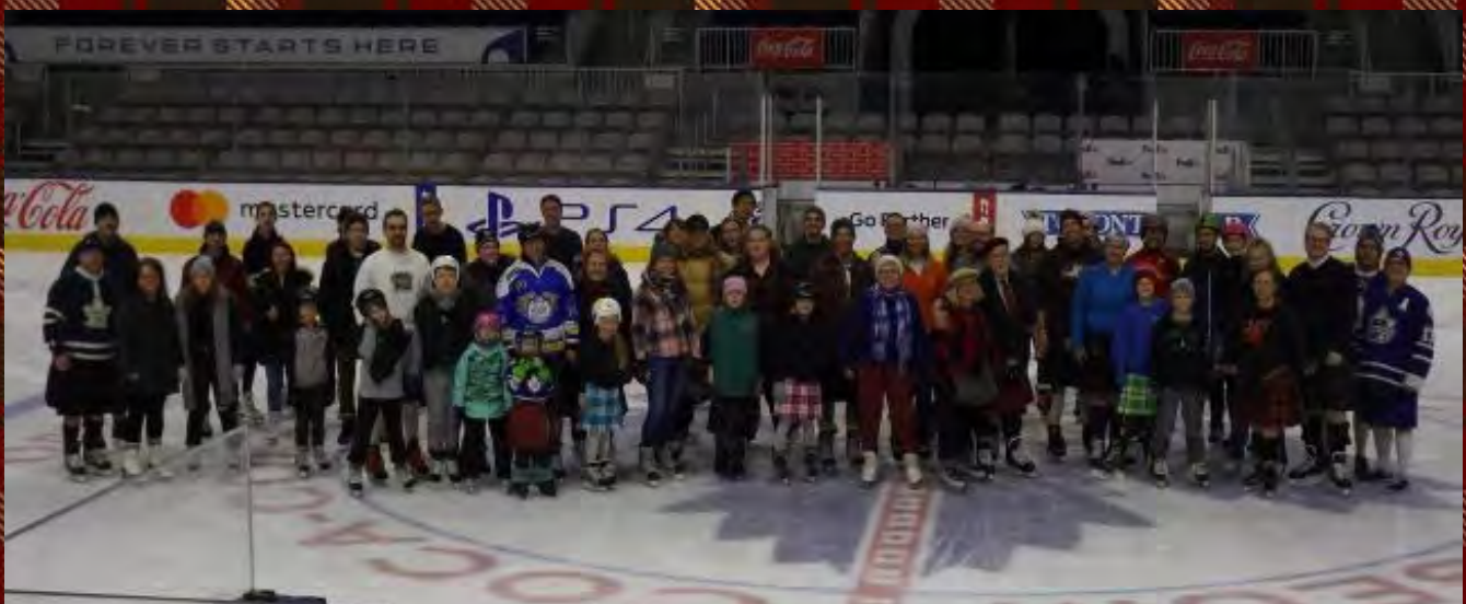
The Great Canadian Kilt Skate 2020 - Toronto

The latest information on the kilt skates can be found at www.kiltskate.com , at www.cassoc.ca and at the website of the Scottish Society of Ottawa - http://ottscot.ca .