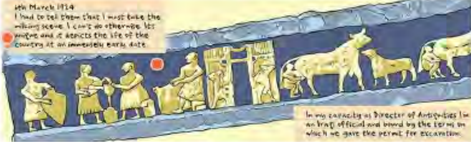
In my capacity as Director of Antiquities (in an Iraq official and bound by the terms in which we gave the permit for excavation.

I had to tell them that I must take the walking scene. I can't do otherwise. We wrote and it depicts the life of the country at an immensely early date.