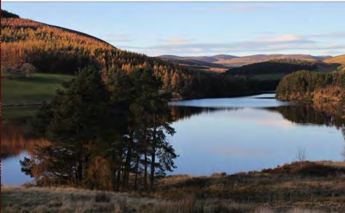
Two photos from the Backwater dam