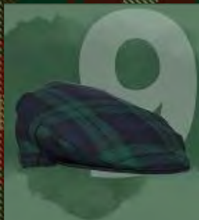
Tartan Flat Cap