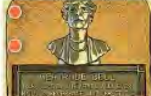
Darling, I must stop now, however deep I get involved in the writing of very long letters. Your loving daughter, Gertrude

Gertrude was found dead from an apparent overdose of sleeping pills on July 12 1926, less than a month after the museum opened. Shortly afterwards King Faisal named one of its rooms in her honour, and a large brass plaque was commissioned to be hung in the museum.