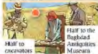
Half to the Baghdad Antiquities Museum

I have a letter from Sir F. Kenyon saying that he holds up the Iraq Dept. of Antiquities as the model for the manner in which the division of Poles is made.