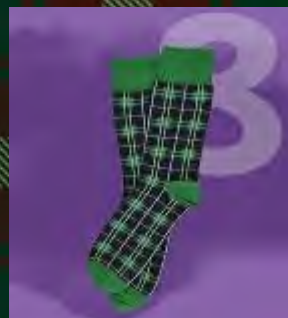
Hibernian Tartan Socks