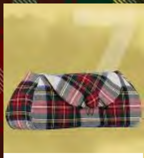
Muckle Peerie Poak Clutch Bag