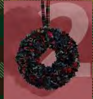
Mixed Tartan Garland