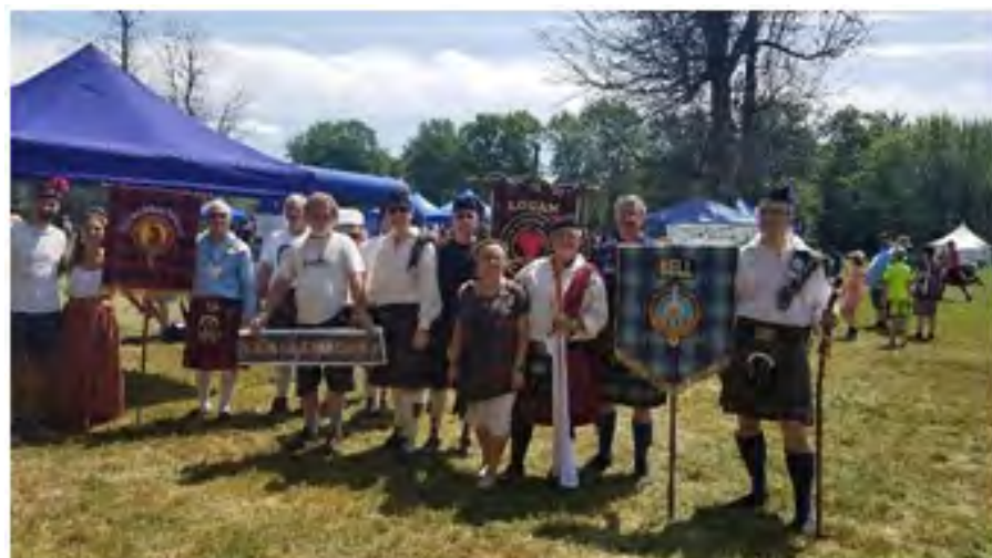
Clan group picture: (from left to right: Clan MacNicol, Clan Lindsay, Clan Logan, Clan Mackenzie (at the back), Clan Gregor, Clan Bell, Clan Macleod)