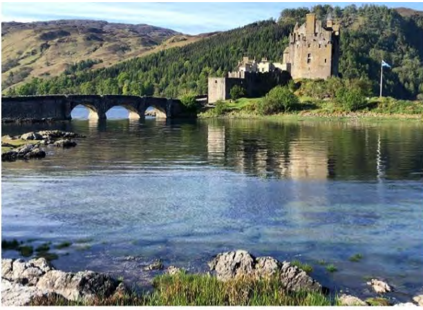
Eilean Donan Castle in Kintail

The Gathering celebrated the 300th Anniversary of the "Attack on Eilean Donan Castle". On May 10th, 1719, the Royal Navy frigates "FLAMBOROUGH, WORCHESTER, and ENTERPRISE" initially fired cannon against the castle walls at Eilean Donan. A landing party ashore took the castle's surrender from its mainly Spanish defenders. It was part of "the Little Rising" and was followed a month later by the Battle of Glenshiel. The landing parties then blew up and destroyed the castle, which remained a ruin until its 20th-century restoration.