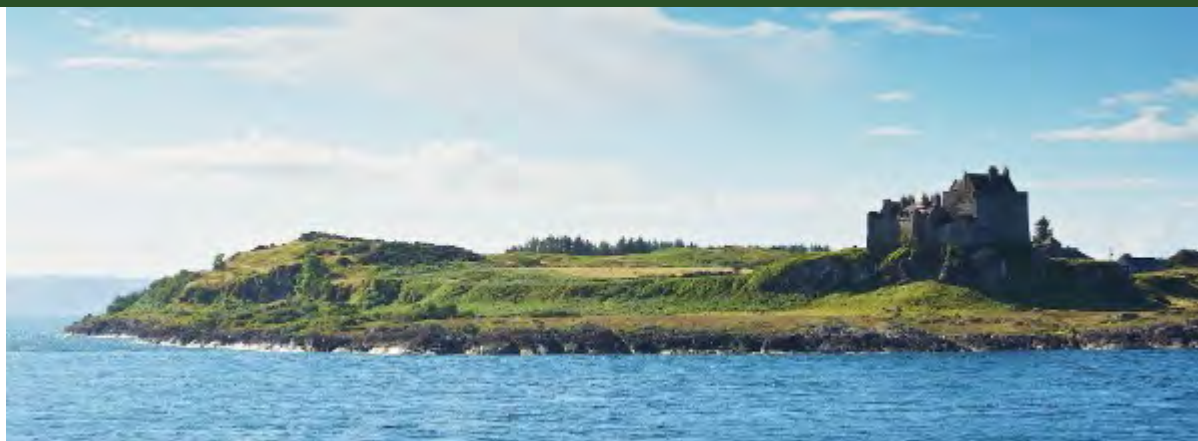
Castle Duart, seat of Clan MacLean (whose Chief is a patron of CASSOC)

Ours thanks to Clan Hunter for this gem!