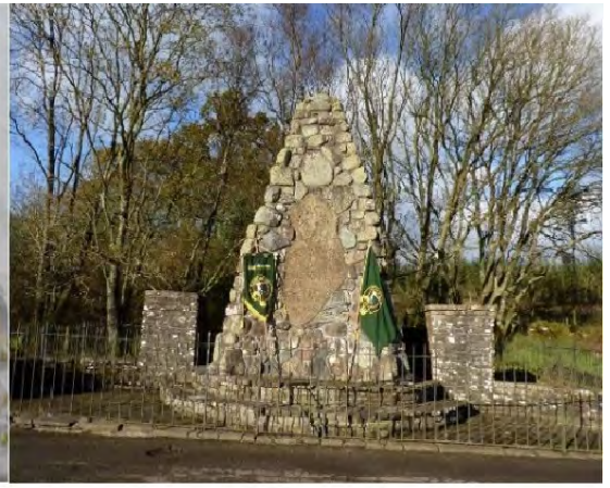
Sheriffmuir - The Clan's Memorial Cairn

The ships "Flamborough, Worcester, & Enterprise" attacking Eilean Donan Castle on May 10th in 1719. Sheriffmuir – the clan's memorial cairn. This past year the delegates attended 16 Highland Games and Festivals in Ontario and met many wonderful MacRaes and Septs of the Clan MacRae. There were also Highland Games attended by our delegates on the Pacific Coast and East Coast as well.