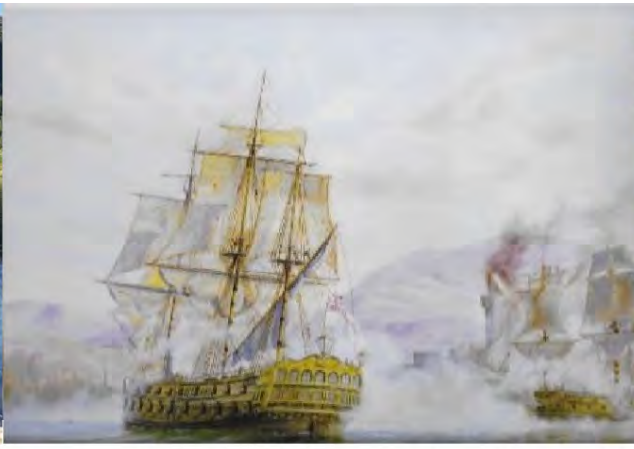
Flamborough, Worcester, and Enterprise attacking on May 10th, 1719